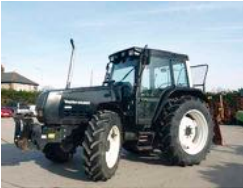
The 100-horsepower 6400 is used for winching and trailer transport.