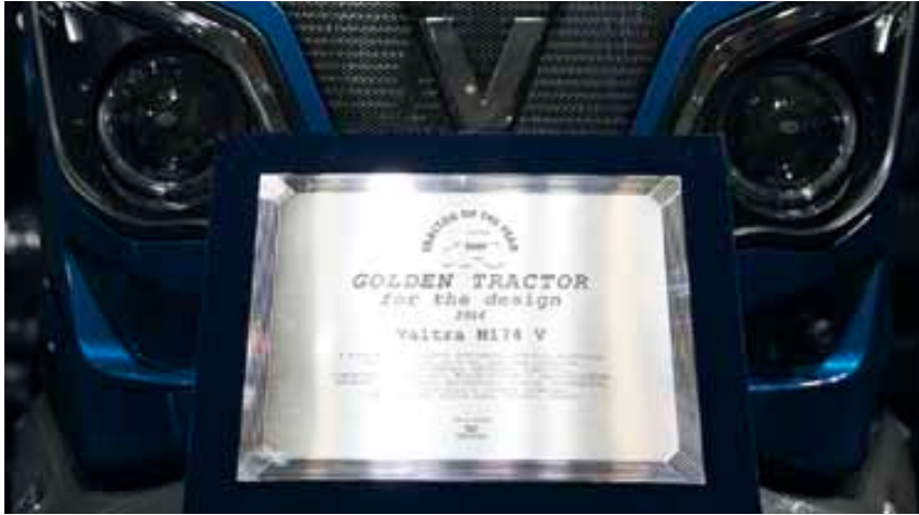
The Valtra N Series claims two awards at Agritechnica: Machine of the Year 2016 and Golden Tractor for Design 2016.