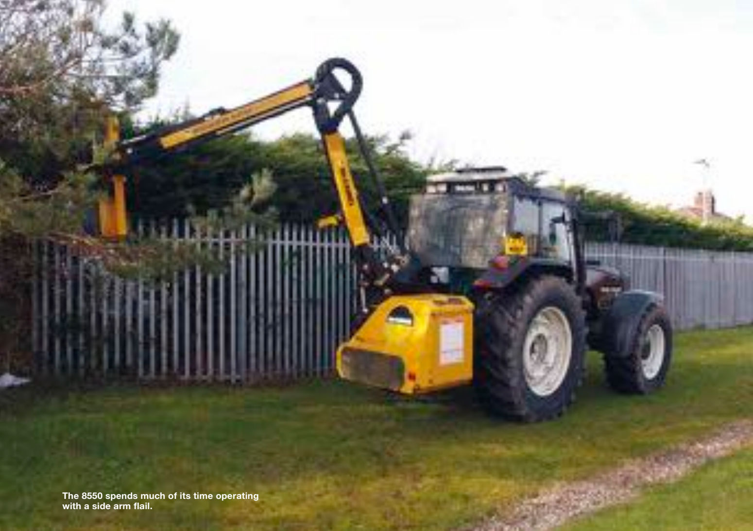
The 8550 spends much of its time operating with a side arm flail.

Proarb owner convinced by reliability of Valtra tractors