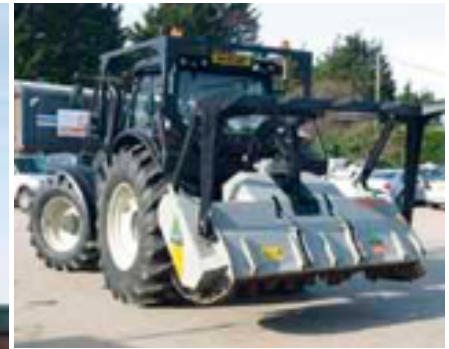
The T203 with TwinTrac and forest protection spends much of the time working with a heavy-duty mulcher maintaining way-leaves.

“With the help of a friend and partner we’re looking at the expanding wood chip and combined heat and power businesses. We have access to the raw products for both operations, and the power could be used here on site in the workshop and office or sold into the grid, while the heat could be used to dry wood chips. It all dovetails nicely into our established business.”